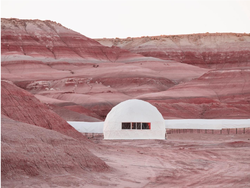
Orejarena & Stein, Life on Mars Training Simulation (2021).

Palo Gallery presents American Glitch , a new exhibition by artist duo Orejarena & Stein (b. 1994, Colombia and United Kingdom), and the photographers' debut solo exhibition in New York City. Presenting a series of new and recent photographs, American Glitch examines the slip between fact and fiction and its manifestation in the physical landscape of the United States, the duo's adopted home. Orejarena & Stein lead us to examine that amidst an overwhelming sea of unending information available in an instant, society is left asking what is real and what's fake. What can the world trust, and what is a 'glitch'?